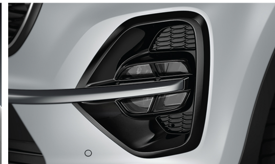
New Ice Cube Fog Lamps**