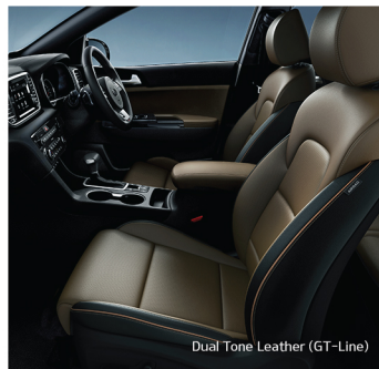
Dual Tone Leather (GT-Line)