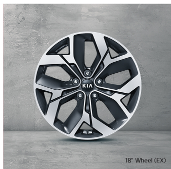
18" Wheel (EX)