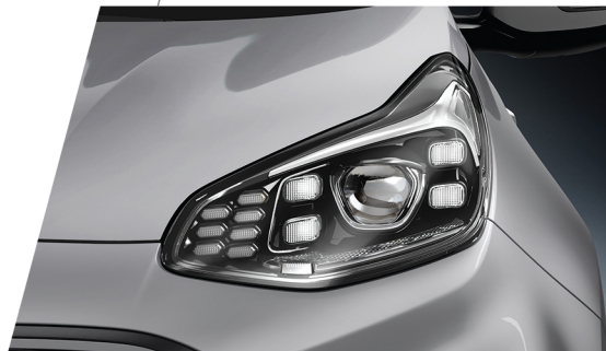
Automatic LED Headlamps with Escort Function