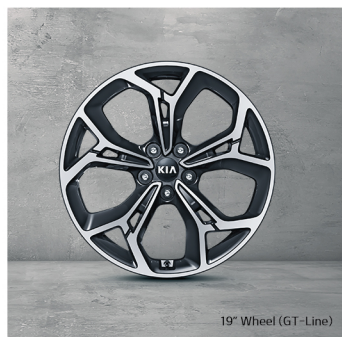
19" Wheel (GT-Line)