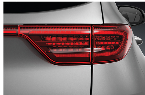
New Rear Combination LED Lamps**