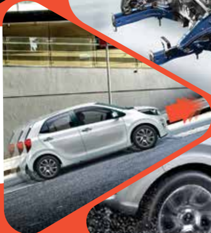
Hill-Start Assist Control (HAC) Prevents sliding off a slope when releasing the brakes.