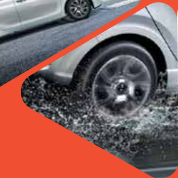
Electric Stability Control (ESC) Reduces loss of traction to minimise potential of skidding.