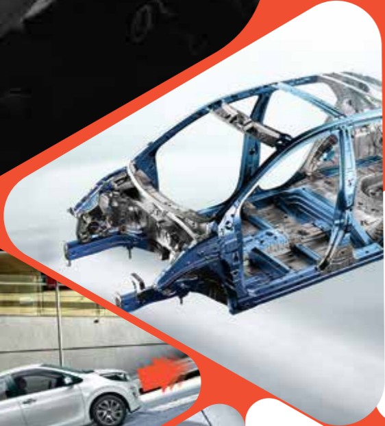
Advanced High-Strength Steel (AHSS) More than 44% AHSS for great rigidity to enhance cabin protection.