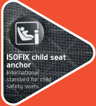
ISOFIX child seat anchor International standard for child safety seats.