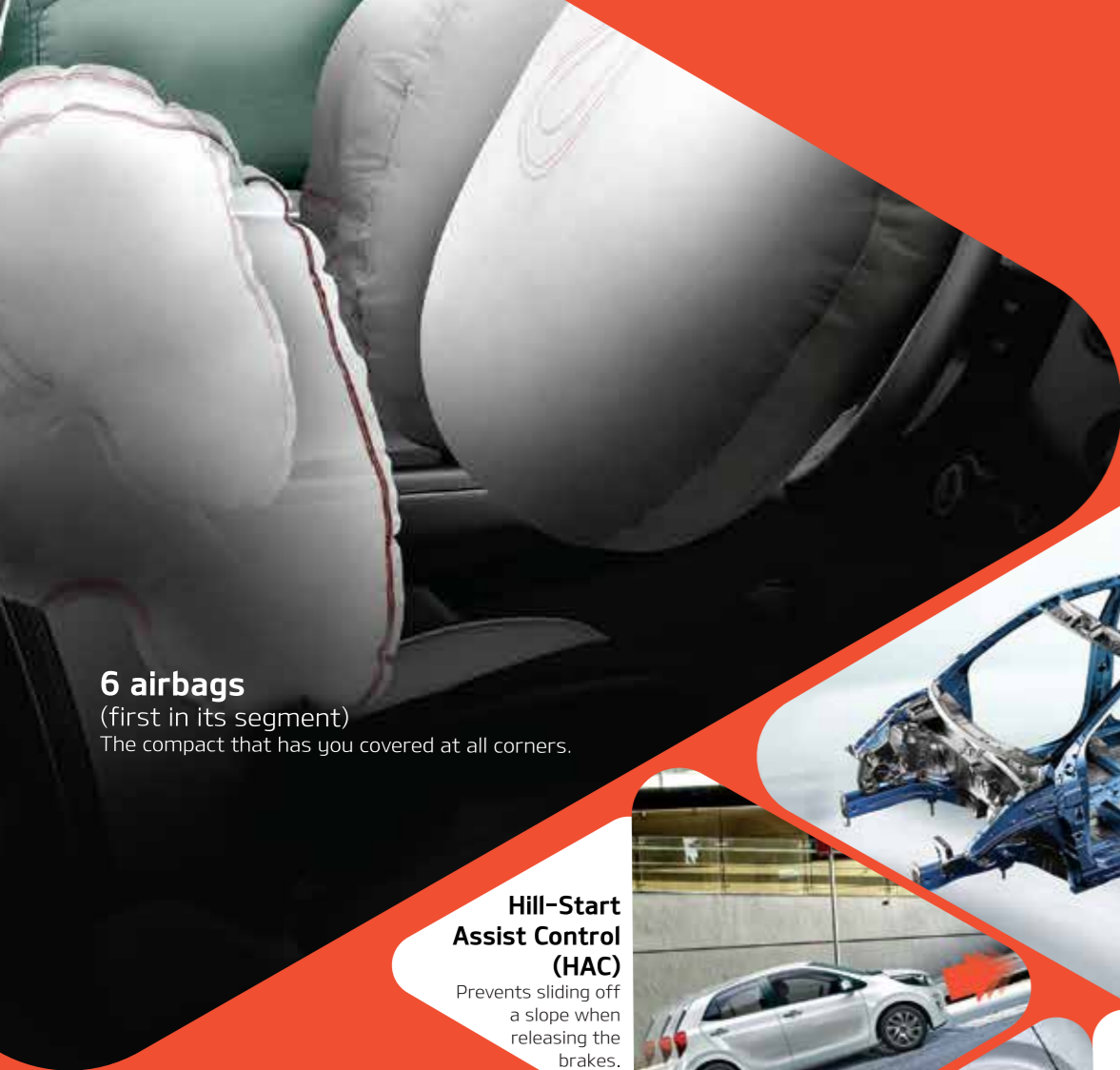
6 airbags (first in its segment) The compact that has you covered at all corners.